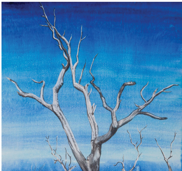
Tiffany Titshall — Drowned Lands (detail), 2021, acrylic, ink and charcoal on paper, 76 x56cm.