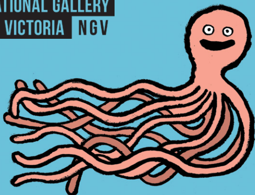
Illustration by Jean Jullien.