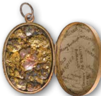
unknown silversmith, Locket c.1860, Australia, gold: engraved, gold-bearing quartz nuggets, printed paper.

The mid-19th century artworks were commissioned by miners who'd struck gold. The tools of the mining trade feature on the design of the earrings as a symbol of