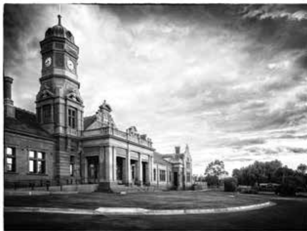
Ian Kemp, Maryborough Railway Station , 2024, Chromoluxe aluminium print.