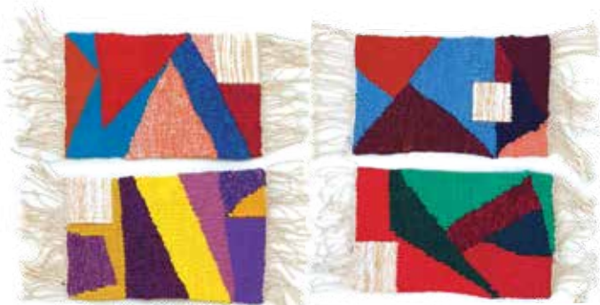
Flossie Peitsch, 10 Oblique , 2023, Billiluna Tapestry Weaving, 200 x 300mm (each panel).