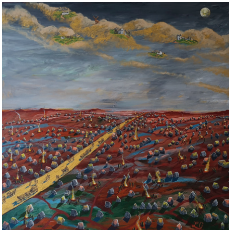
Linda Gallus, Field of Dreams , 2024. Acrylic on canvas. 92cm x 92cm.

Exhibition opening: 2pm, Saturday 11 October 2025