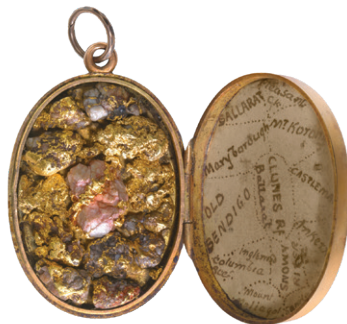
unknown silversmith, Locket , c.1860, Australia, gold: engraved, gold-bearing quartz nuggets, printed paper. National Gallery of Australia, Kamberrri Canberra

Come on the journey with us as we present a program of exhibitions and programs celebrating this remarkable display of golden treasures.